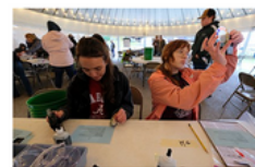
Environmental Service and Natural Resources Salt Lake City, Utah Sept. 10-14, 2024

Application Opens: Aug 15, 2023 Application Closes: May 15, 2024