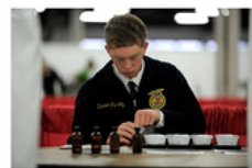
Food Products and Processing Systems Minneapolis, Minn. June 25-29, 2024

Application Opens: Aug 15, 2023 Application Closes: March 15, 2024